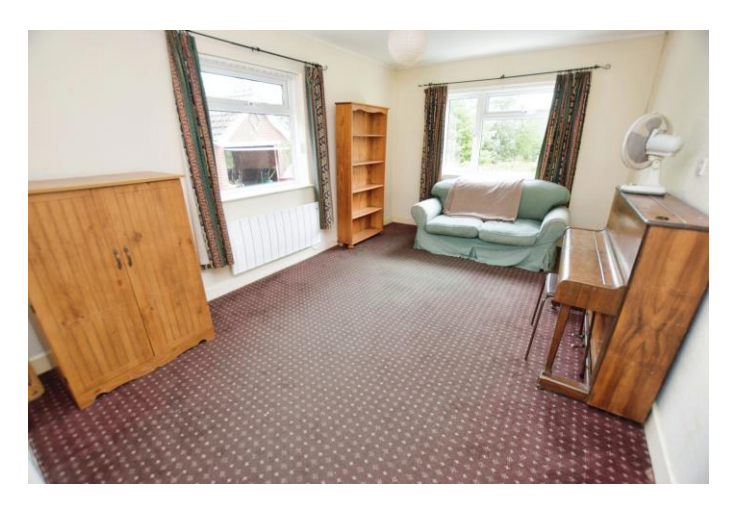
Bedroom Three 10' 1" x 11' 6" (3.070m x 3.499m) Dual aspect uPVC double glazed windows. Built in storage cupboard. Electric wall mounted radiator.

Bedroom Two 16' 0" x 10' 8" (4.878m x 3.253m) Dual aspect uPVC double glazed windows. Built in wardrobe with hanging space. Wall mounted radiator.