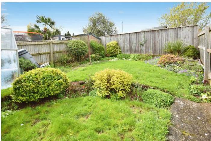
Private enclosed rear garden mainly laid to lawn with paved seating area, mature trees, shrub borders, greenhouse, wooden side gate providing access to the garage and share driveway to the side of the house.