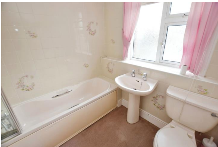
Rear aspect uPVC double glazed frosted window, three piece suite comprising, panel enclosed bath with mixer taps, low level WC, wash hand basin, part tiled walls and radiator.