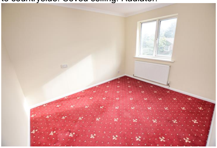
Bedroom Five 8' 1" x 7' 10" (2.46m x 2.39m) Front aspect uPVC double glazed window, radiator.