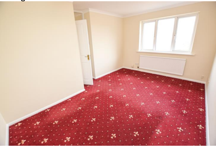
Bedroom Three 9' 11" x 14' 7" (3.019m x 4.453m) Rear aspect uPVC double glazed window with views to countryside. Coved ceiling. Radiator.