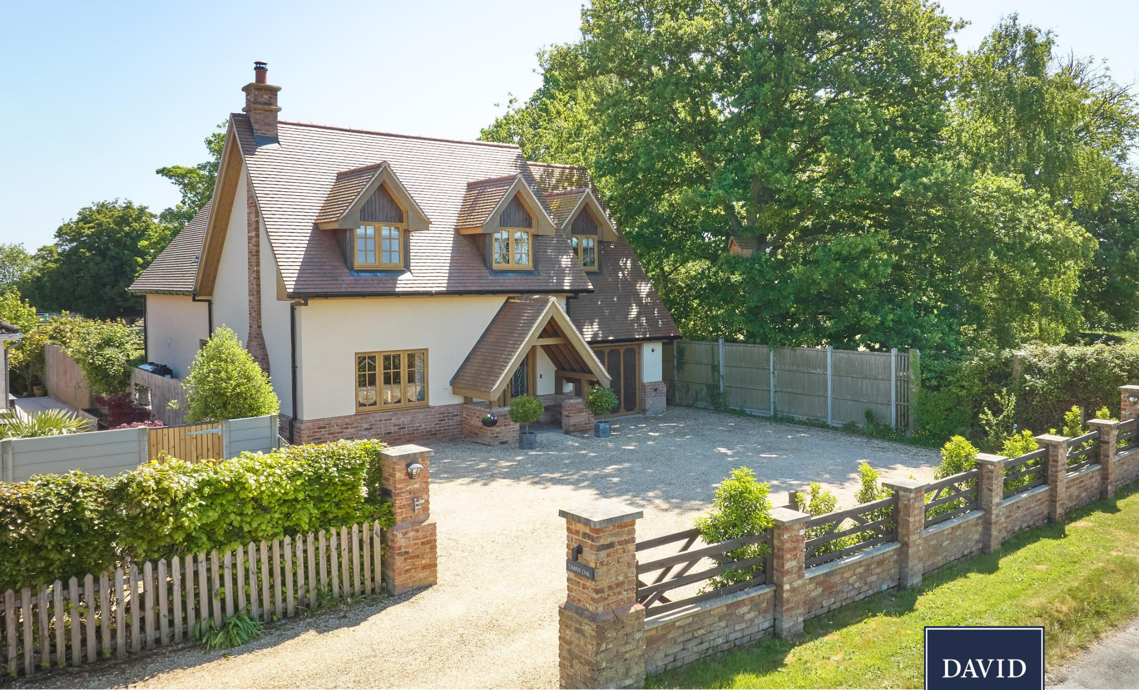
Tawny Oak Kirtling, Suffolk