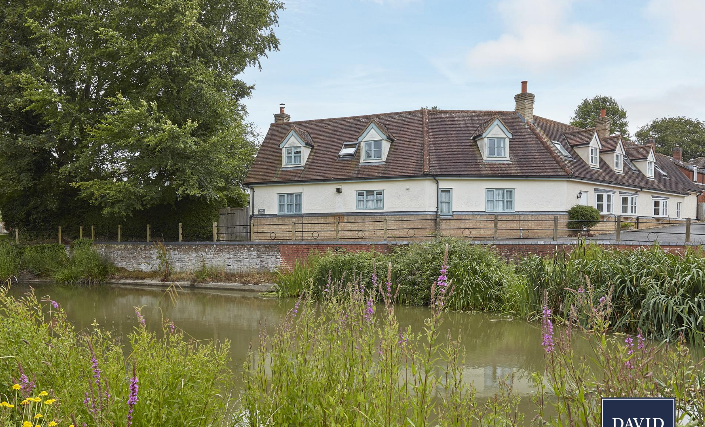
Pond Cottage Ashley, Cambridgeshire