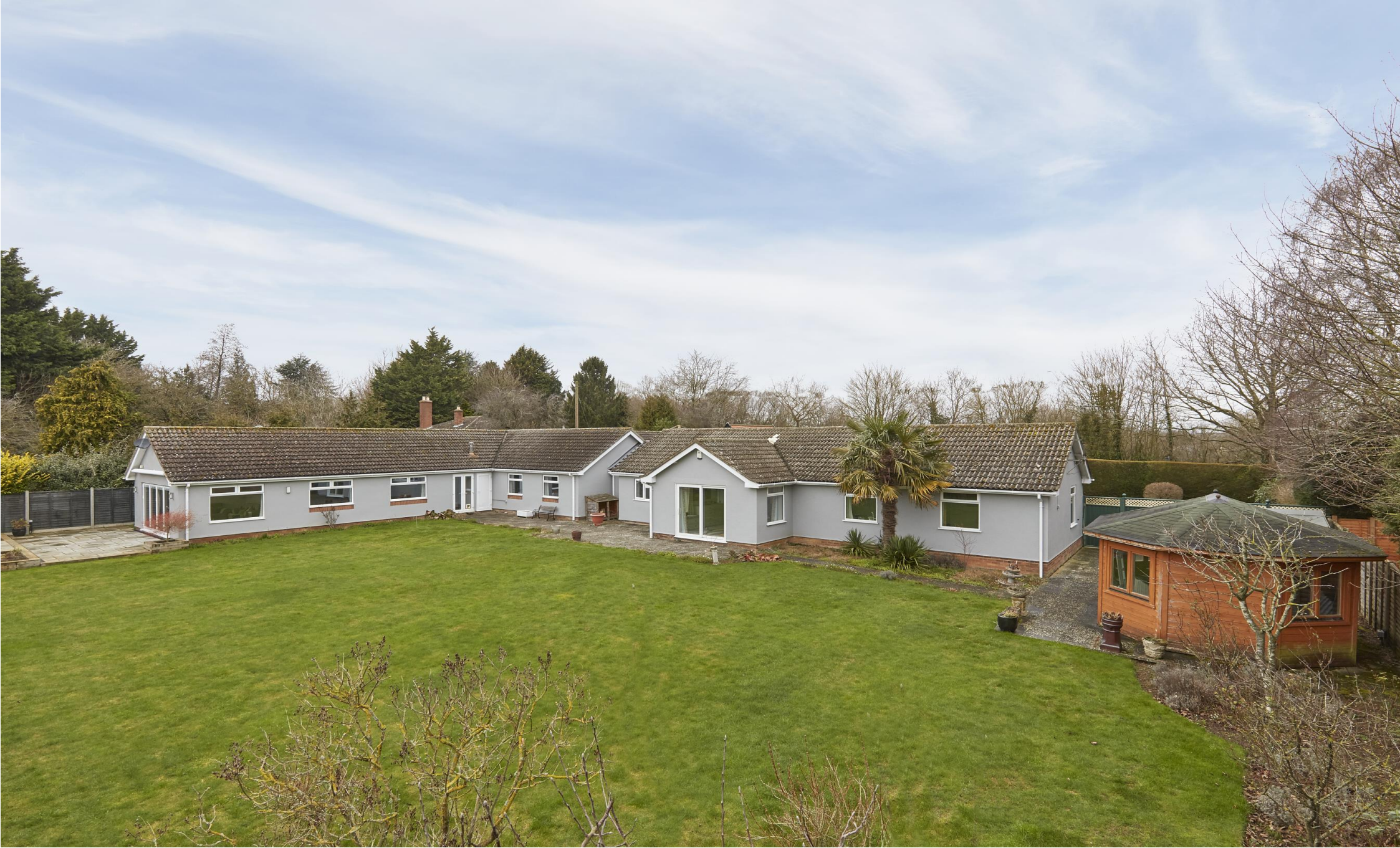
Fieldfare Wickhambrook, Suffolk