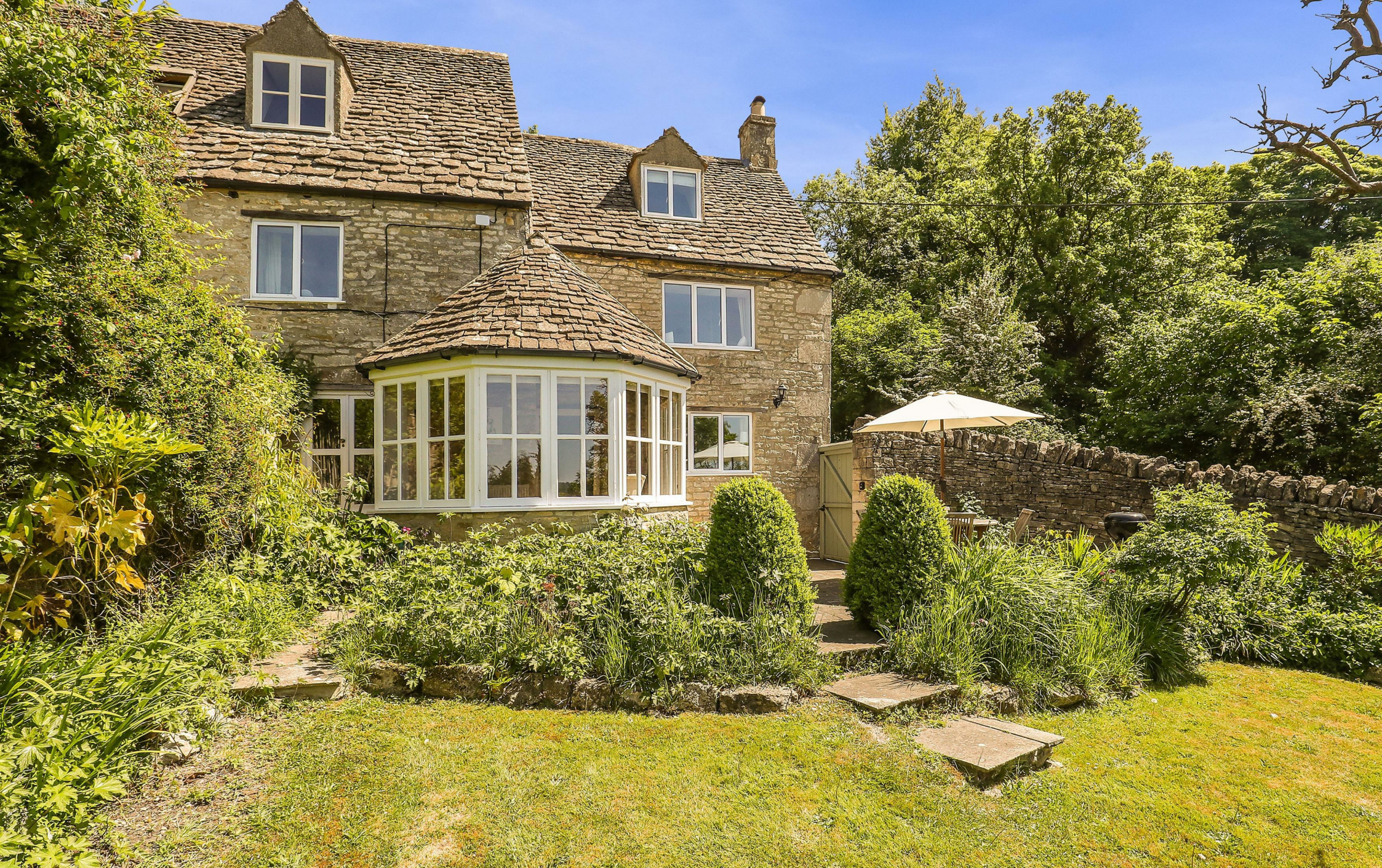
GRANGE COTTAGE · AMBERLEY · STROUD