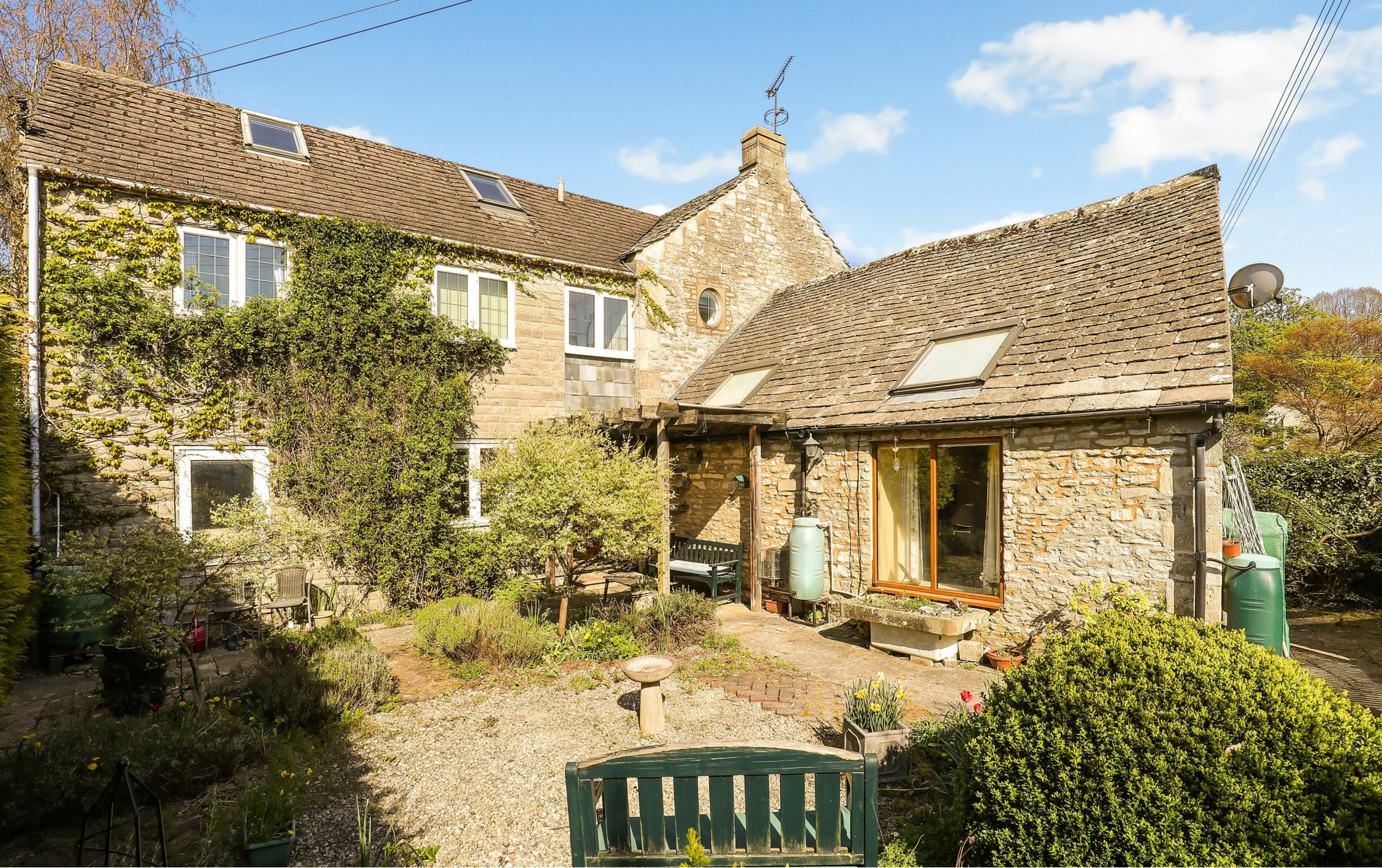
PARK COTTAGE · SCHOOL LANE · MINCHINHAMPTON