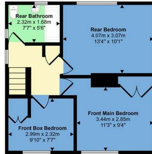
First Floor Approx 43 sq m / 462 sq ft

This floorplan is only for illustrative purposes and is not to scale. Measurements of rooms, doors, windows, and any items are approximate and no responsibility is taken for any error, omission or mis-statement. Icons of items such as bathroom suites are representations only and may not look like the real items. Made with Made Snappy 360.