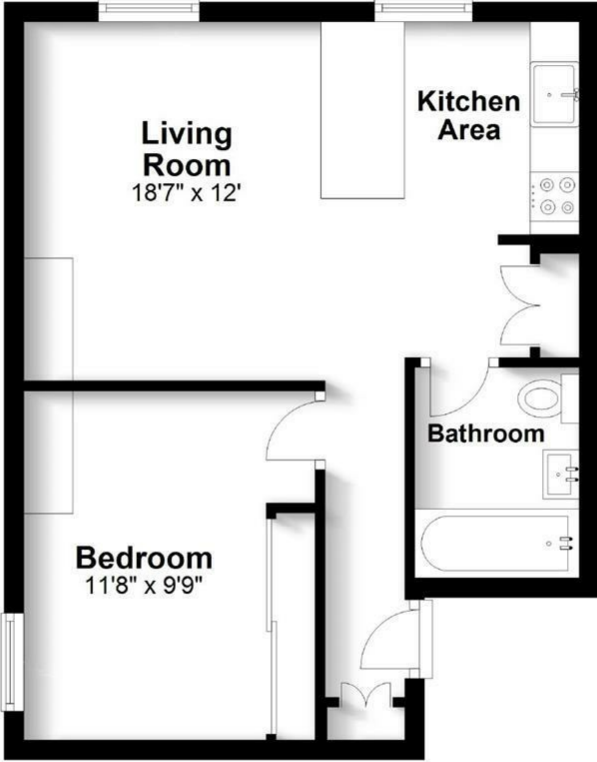
Total area: approx. 413.4 sq. feet

Produced for Cassidy & Tate Estate Agents For guidance purposes only. Not to scale.