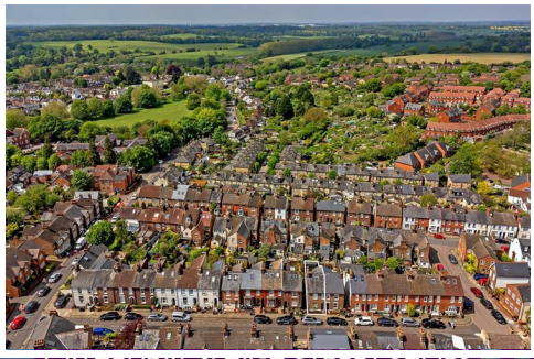
CATHEDRAL & HIGH STREET SHOPS 0.5 MILES / 12 MINUTE WALK