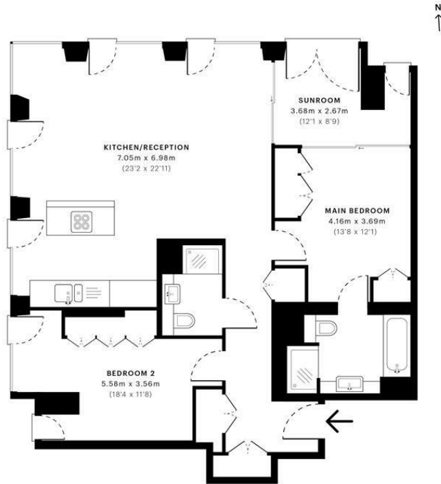
— Twenty-First Floor