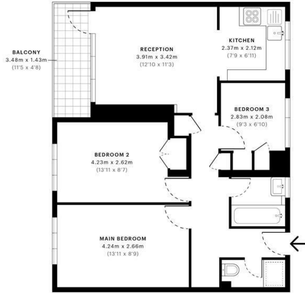
— Third Floor