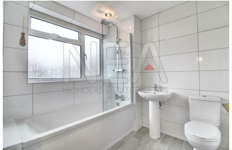
Tiled, bath with shower over, WC & sink.