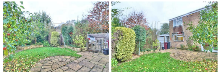
The garden is to the front of the property and has patio immediately outside house, lawn area and raised beds with a built in barbecue. There is a large storage shed.