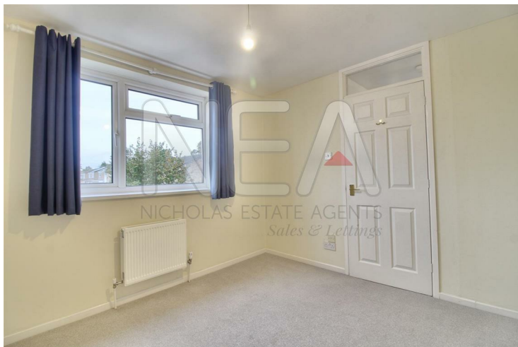
Carpeted double bedroom with window to front