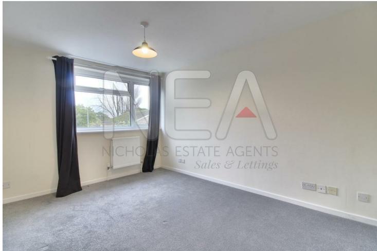
Carpeted double bedroom, window to rear