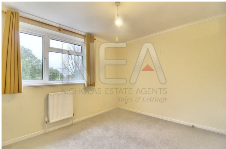
Carpeted double bedroom with window to rear