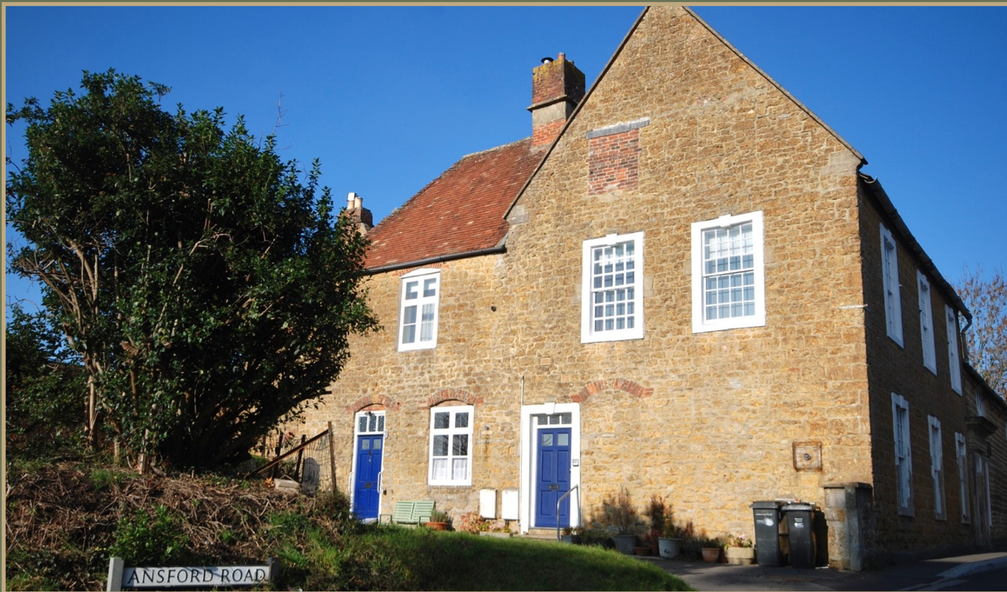
FLAT 5, THE OLD ANSFORD INN, HIGHER ANSFORD, CASTLE CARY, BA7 7JG