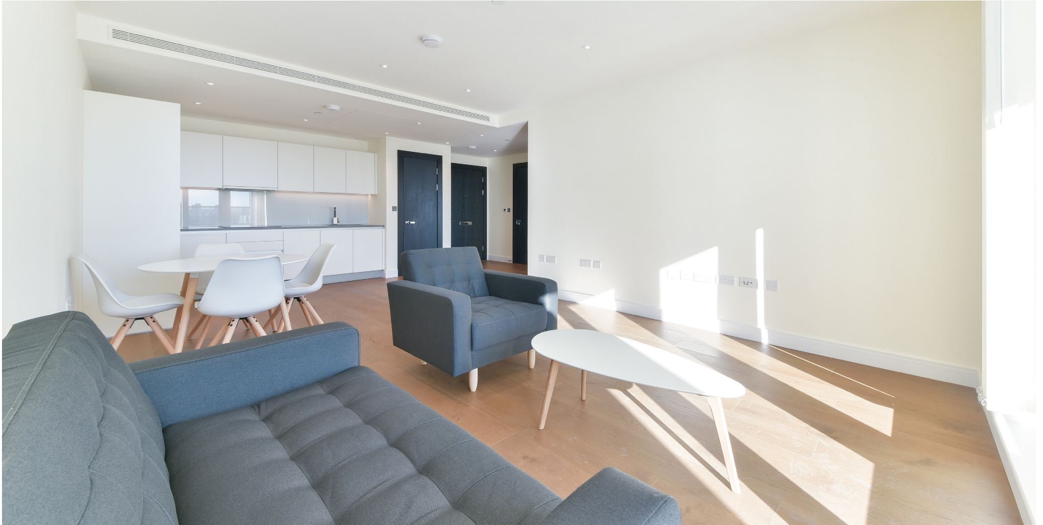
SOPHORA HOUSE, Battersea SW11