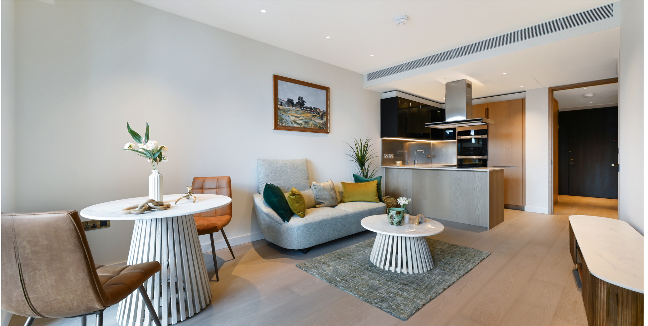
RIVER TOWER, Nine Elms SW8