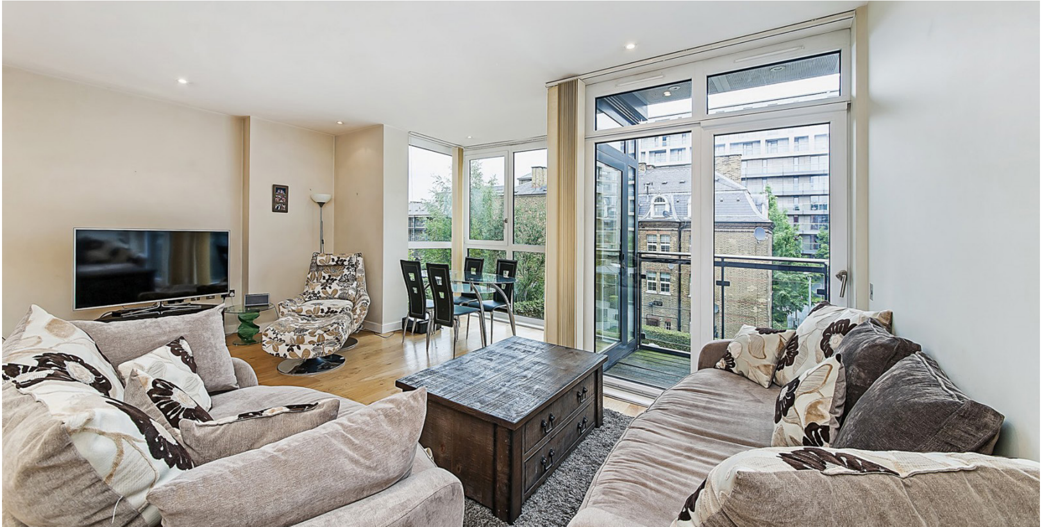
HEPWORTH COURT, Chelsea SW1W