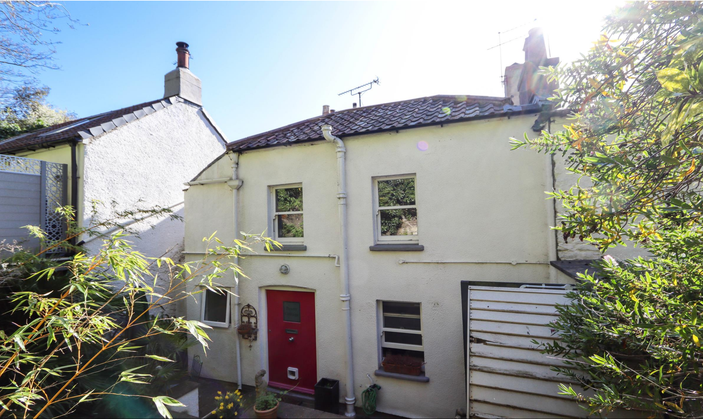
Penny Cottage, 83a Hill Road, Clevedon, BS21 7PL £395,000