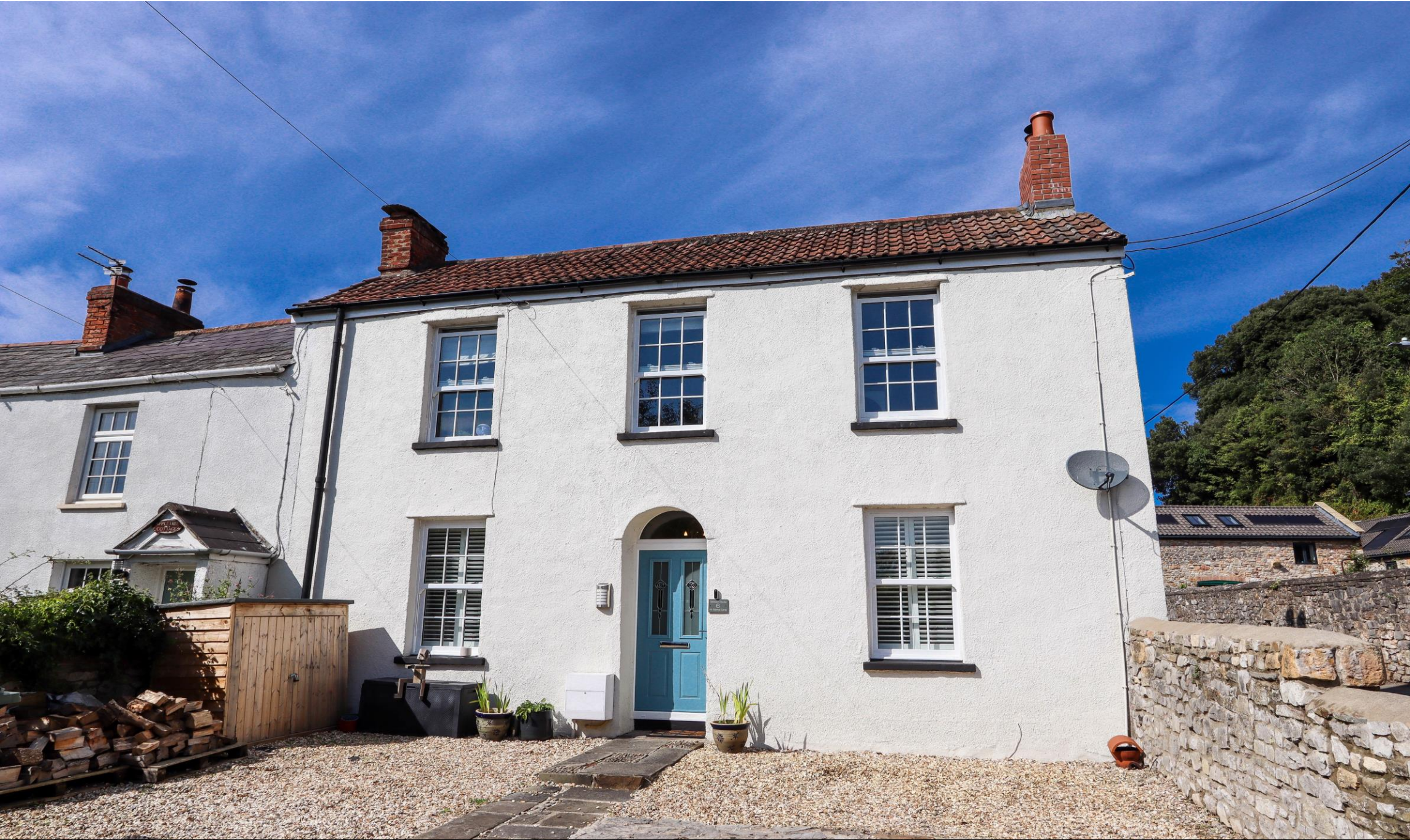
Clevedon House, 6 All Saints Lane, Clevedon, BS21 6AY £499,950