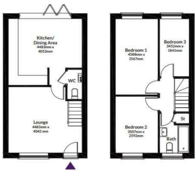
PLOTS 15, 16 & 17 - 3 BEDS