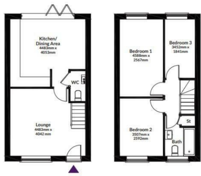
PLOTS 15, 16 & 17 - 3 BEDS