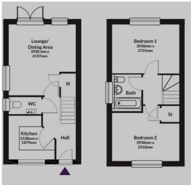
PLOT 11 - 2 BED