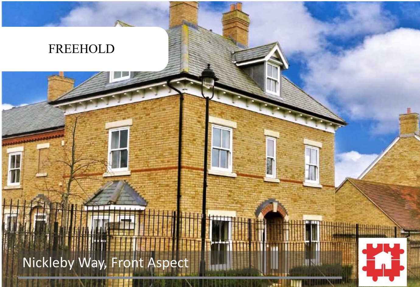
Nickleby Way, Front Aspect