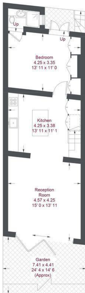
Lower Ground Floor 588 sq ft / 54.6 sq m (Including Reduced Headroom)