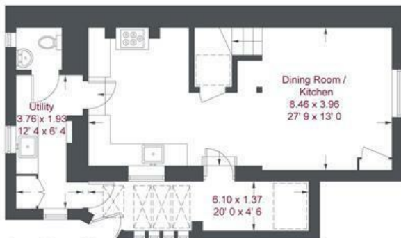
Lower Ground Floor 577 sq ft / 53.6 sq m (Including Reduced Headroom)