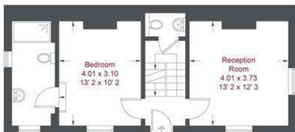
Ground Floor 452 sq ft / 42 sq m