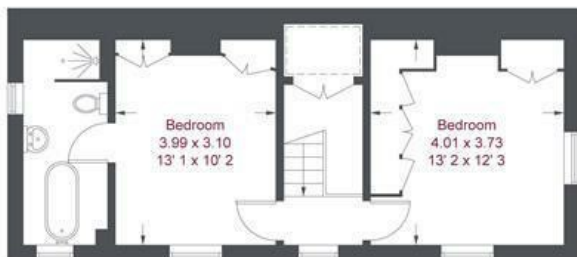
First Floor 450 sq ft / 41.8 sq m (Including Reduced Headroom)