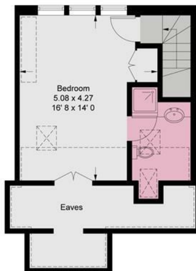
Second Floor 409 sq ft / 38 sq m (Including Reduced Headroom / Eaves)

This plan is not to scale and must be used as layout guidance only. All measurements and areas are approximate and should not be relied upon to provide accurate information. This plan must not be relied upon when making property valuations, design considerations or any other such relevant decisions. We accept no responsibility or liability (whether in contract, tort or otherwise) in relation to any loss whatsoever arising from or in connection with any use of this plan or the adequacy, accuracy or completeness of it or any information within it.