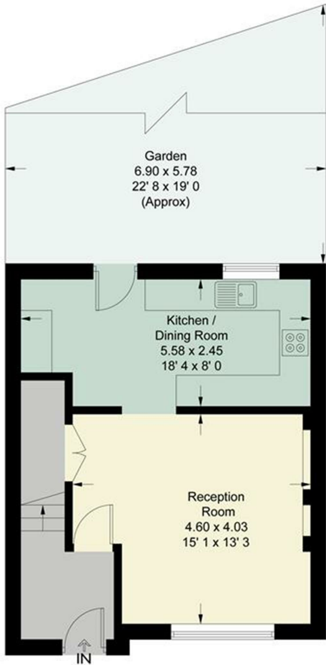
Ground Floor 409 sq ft / 38 sq m