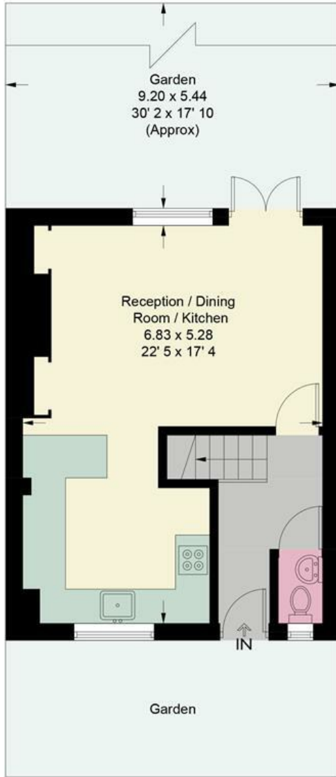
Ground Floor 410 sq ft / 38.1 sq m