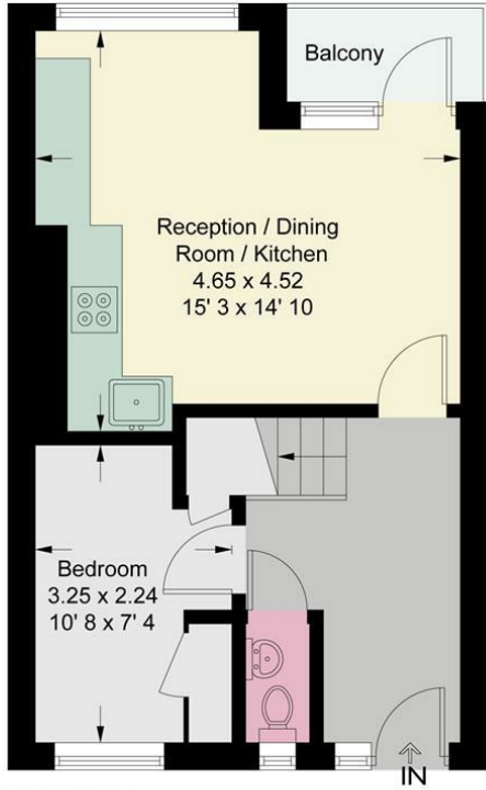
Third Floor 378 sq ft / 35.1 sq m