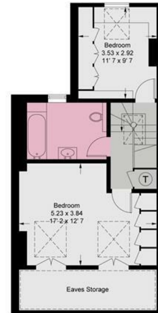
Second Floor 577 sq ft / 53.6 sq m (Including Reduced Headroom / Eaves Storage)