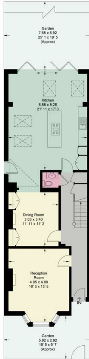
Ground Floor 924 sq ft / 85.8 sq m