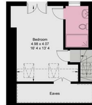
Second Floor 362 sq ft / 33.6 sq m (Including Reduced Headroom / Eaves)