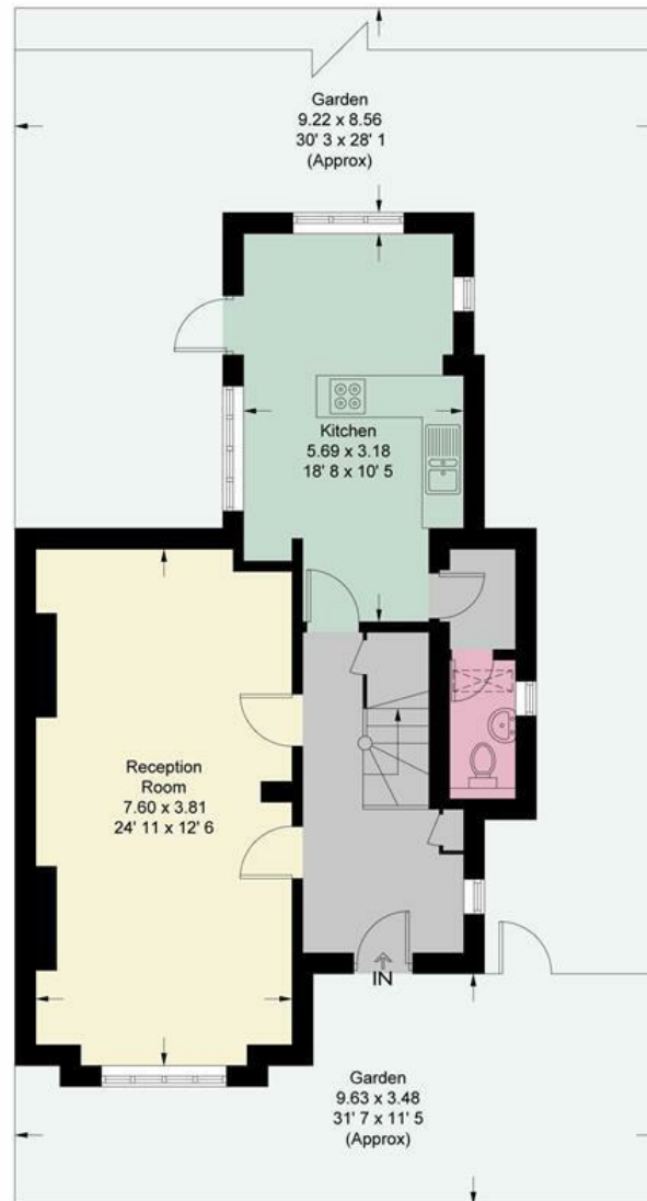
Ground Floor 653 sq ft / 60.7 sq m