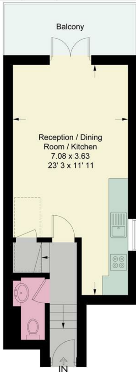
Ground Floor 318 sq ft / 29.5 sq m (Including Reduced Headroom)