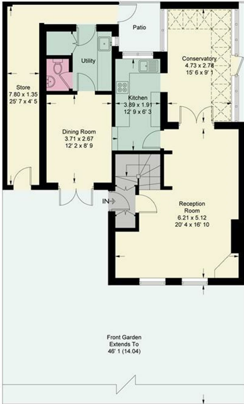
Ground Floor 770 sq ft / 71.5 sq m