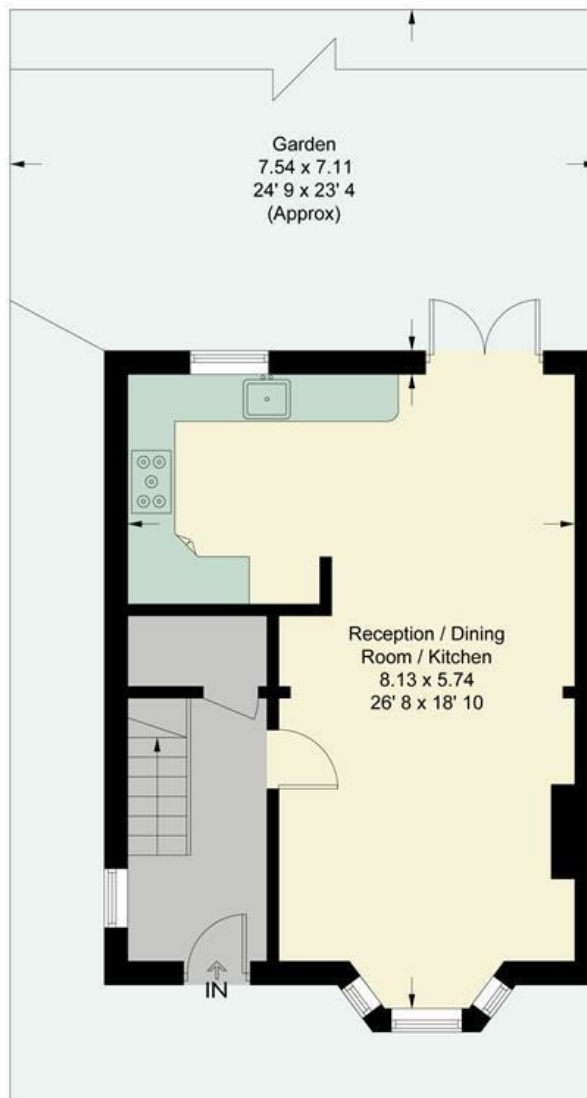
Ground Floor 487 sq ft / 45.2 sq m