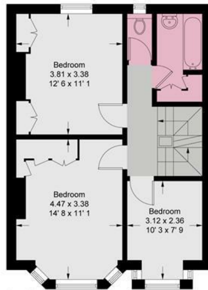
First Floor 522 sq ft / 48.5 sq m

This plan is not to scale and must be used as layout guidance only. All measurements and areas are approximate and should not be relied upon to provide accurate information. This plan must not be relied upon when making property valuations, design considerations or any other such relevant decisions. We accept no responsibility or liability (whether in contract, tort or otherwise) in relation to any loss whatsoever arising from or in connection with any use of this plan or the adequacy, accuracy or completeness of it or any information within it.