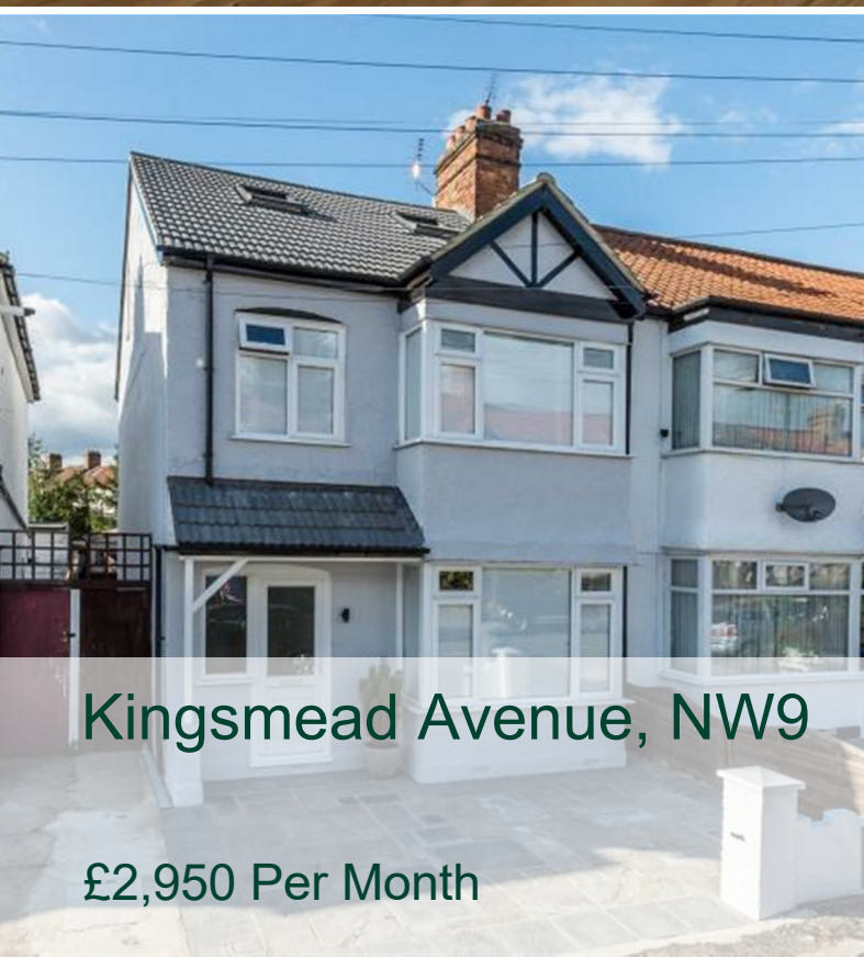
Kingsmead Avenue, NW9