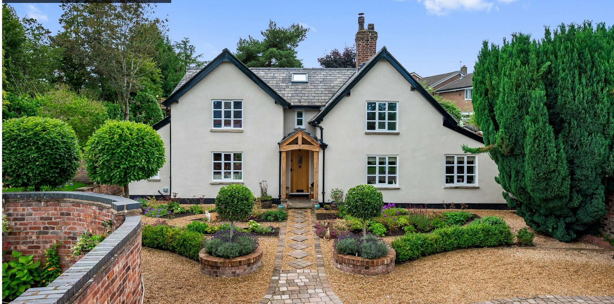
The Cottage 10 Fletchers Lane, Lymm, Cheshire, WA13 9PP £4,750 Per Month