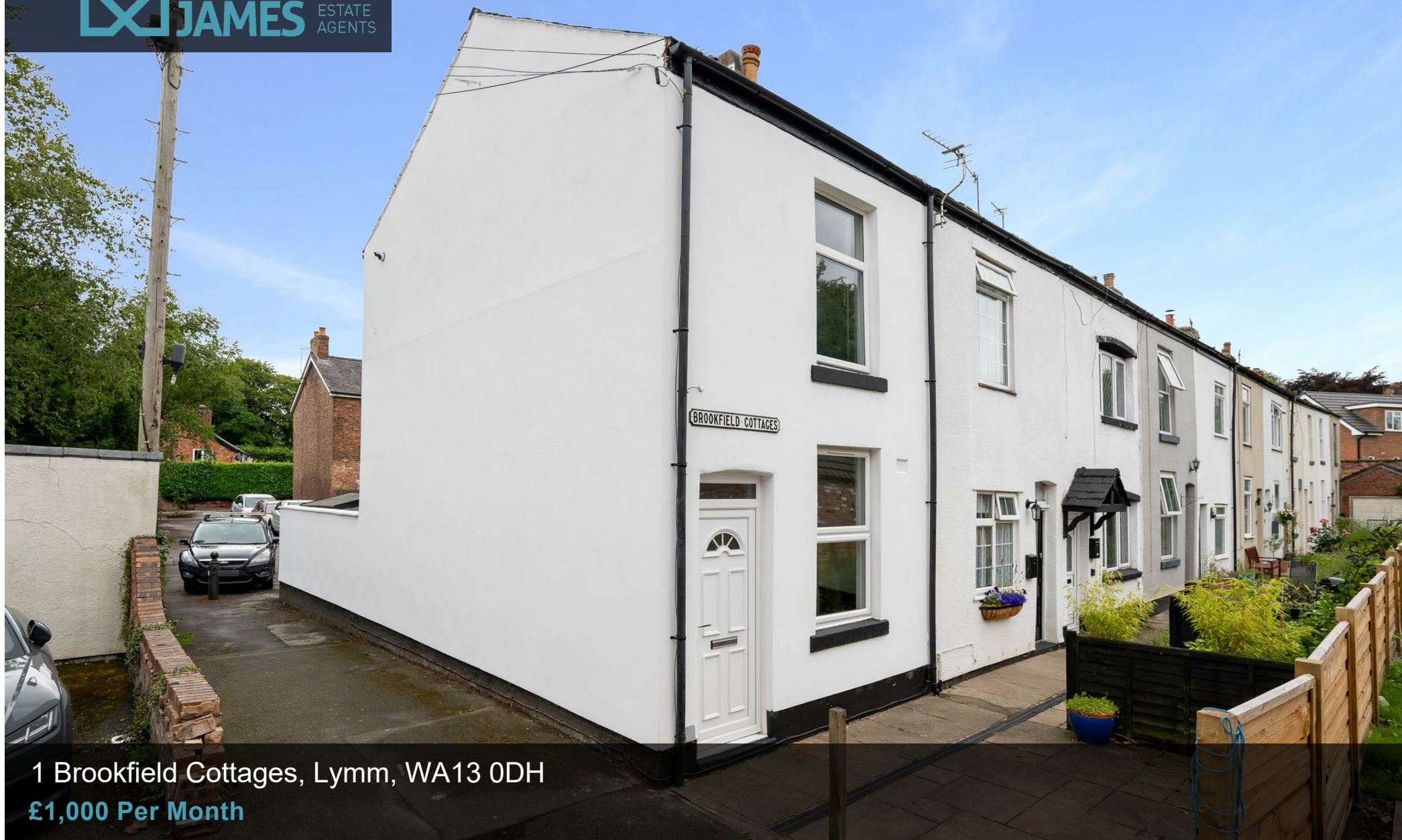
1 Brookfield Cottages, Lymm, WA13 0DH £1,000 Per Month