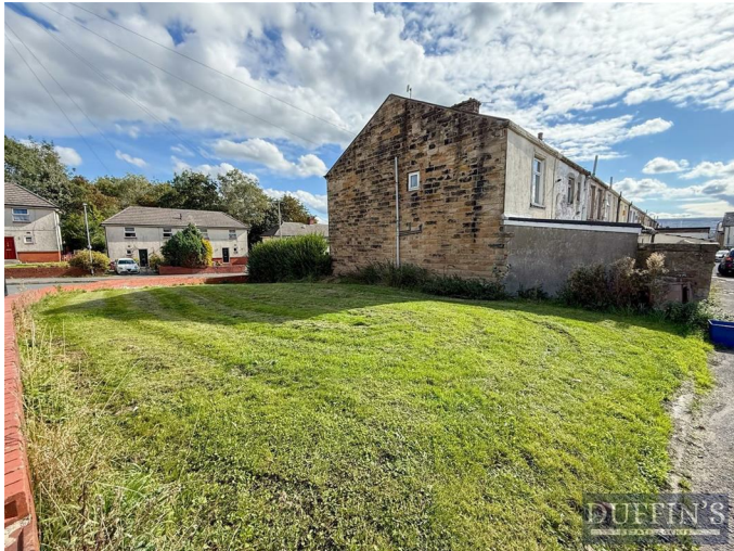
Plot of Land to the side of the property