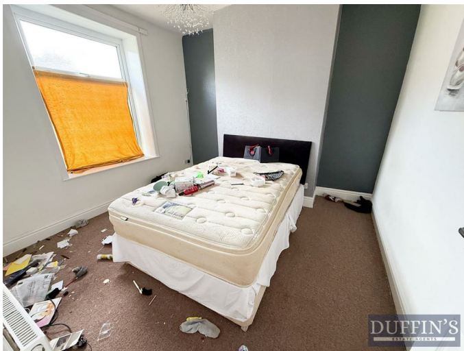
Reception Room One 10'7" x 11'3" (3.24m x 3.43m)