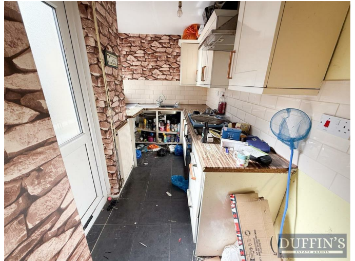
Kitchen 4'1" x 10'5" (1.25m x 3.19m)