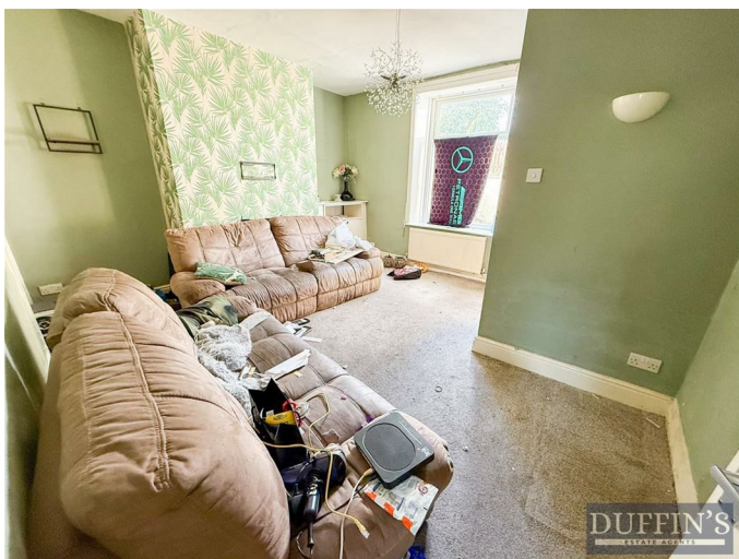
Second Reception Room 14'7" x 10'7" (4.45m x 3.24m)