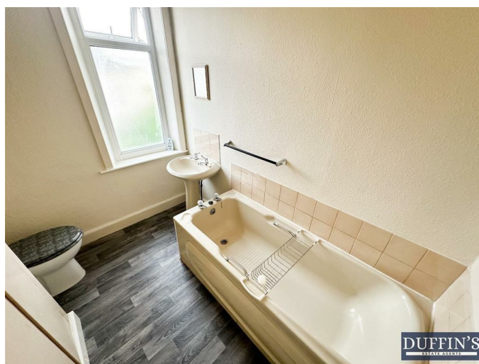
Bathroom 6'8" x 8'3" (2.05 x 2.53)