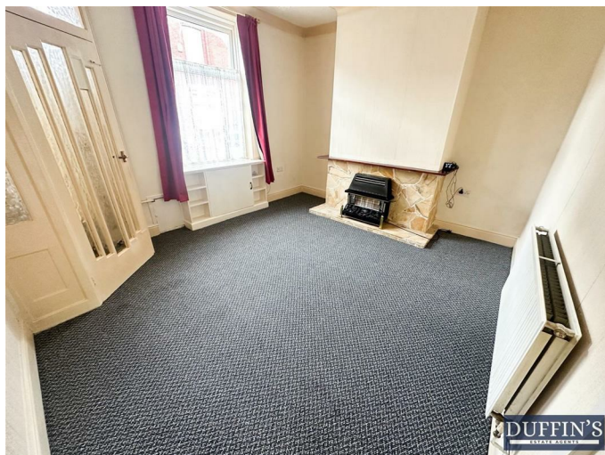
Lounge 14'0" x 12'4" (4.29 x 3.76)