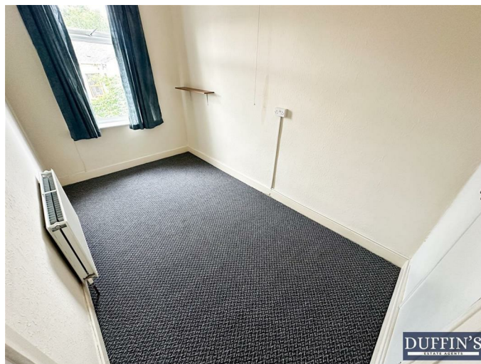
Second Bedroom 12'10" x 7'4" (3.93 x 2.24)