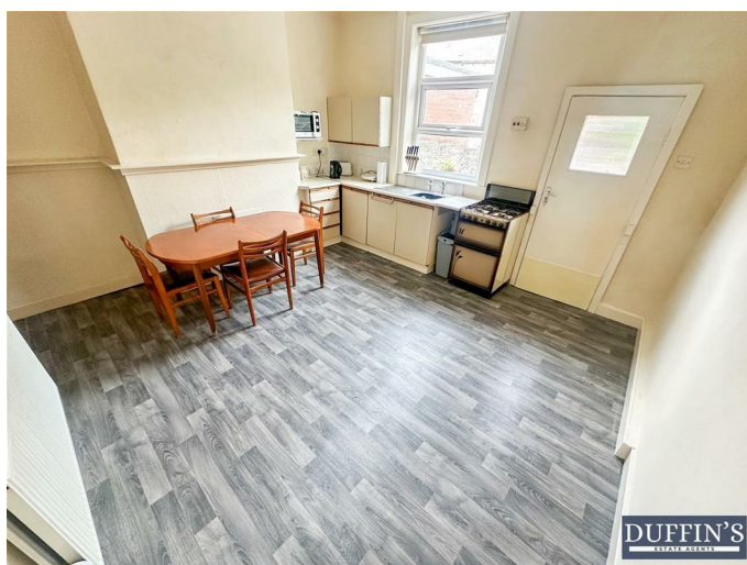
Kitchen 13'8" x 14'4" (4.18 x 4.37)