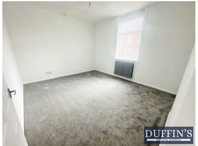
Master Bedroom 12'5" x 14'9" (3.8 x 4.50)

Spacious master bedroom offering ample space. The room benefits from UPVC double glazed window, white painted walls and white glossed woodwork, luxurious grey carpet, central heating radiator and ceiling light.