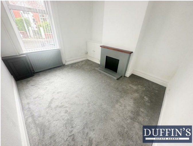
Reception Room One 12'4" x 11'7" (3.78 x 3.55)

Light and Airy Reception Room comprising of: UPVC double glazed window, fresh white painted walls and white glossed woodwork, luxurious grey carpet, central heating radiator, ceiling light, television point and fireplace surround.