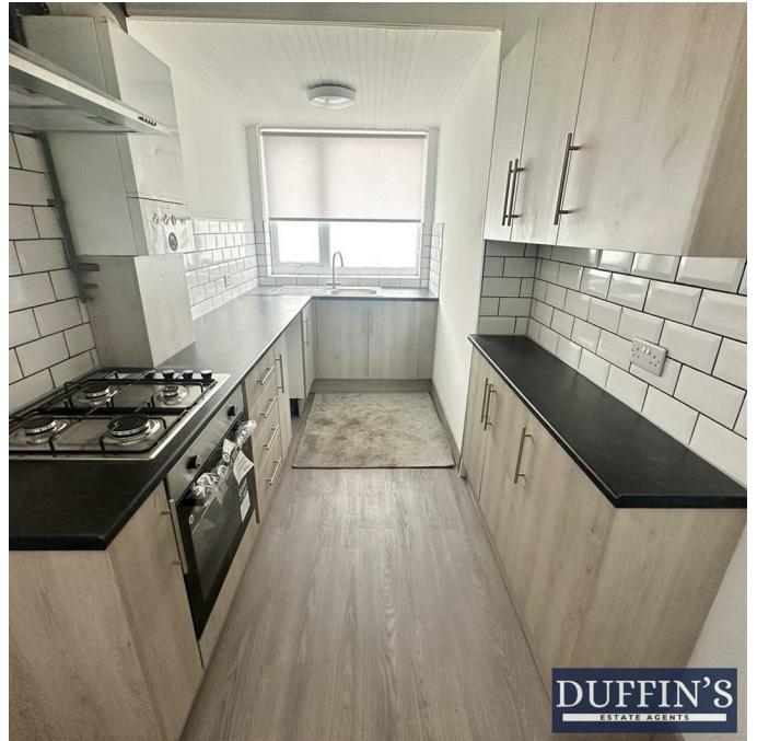
Kitchen 6'6" x 14'1" (2 x 4.30)

Brand New Kitchen featuring UPVC double glazed window, rear door, painted white walls and white glossed woodwork, laminate wall and base units, laminate work tops, stainless steel sink with mixer tap, fitted oven, electric hob, extractor fan, plumbing for washing machine, combination boiler and lino flooring.