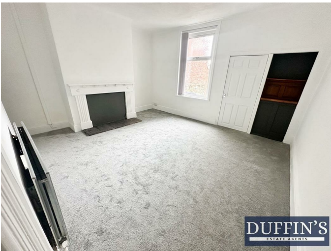
Reception Room Two 13'3" x 16'8" (4.05 x 5.10)

A spacious second reception room comprising of: UPVC double glazed window, fresh white painted walls and white glossed woodwork, luxurious grey carpet, central heating radiator, ceiling light, television point and fireplace surround.