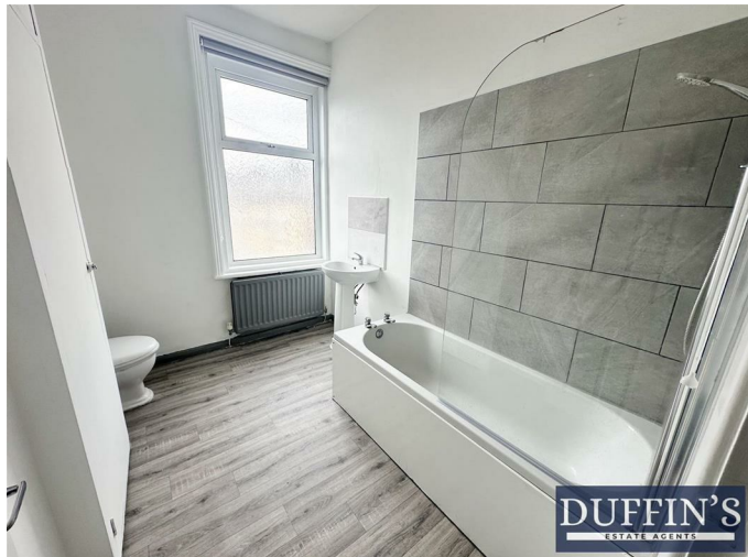
Bathroom 9'10" x 6'6" (3 x 2)

Brand New Bathroom offering: Double glazed uPVC window with frosted glass. central heating radiator, vinyl flooring, part tiled walls, ceiling light. Low level WC, bath, electric shower over bath and pedestal sink.