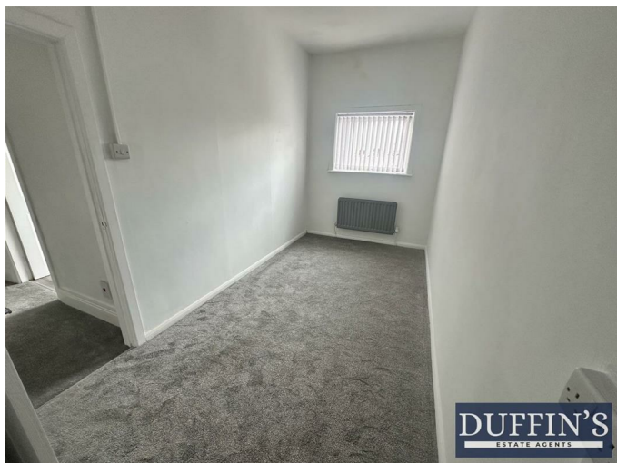
Second Bedroom 14'7" x 6'6" (4.45 x 2)

A good size second bedroom offering ample space. The room benefits from UPVC double glazed window, white painted walls and white glossed woodwork, luxurious grey carpet, central heating radiator and ceiling light.