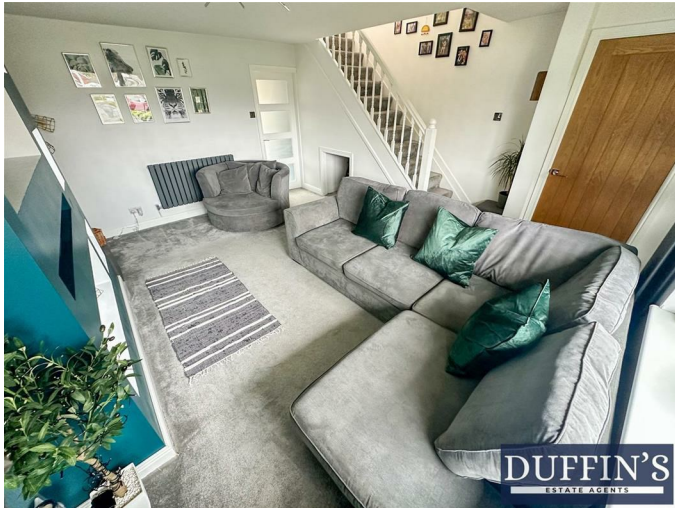
Lounge 15'10" x 15'2" (4.84 x 4.64)

This stunning lounge favours a stylish media wall, grey fitted carpet, understairs storage, cloak room, UPVC double glazed window and UPVC double glazed front door. The lounge also compliments a glass panel door to the kitchen, stylish gas central heating panelled radiators and ceiling light. This really is a lovely family space to enjoy winding down.