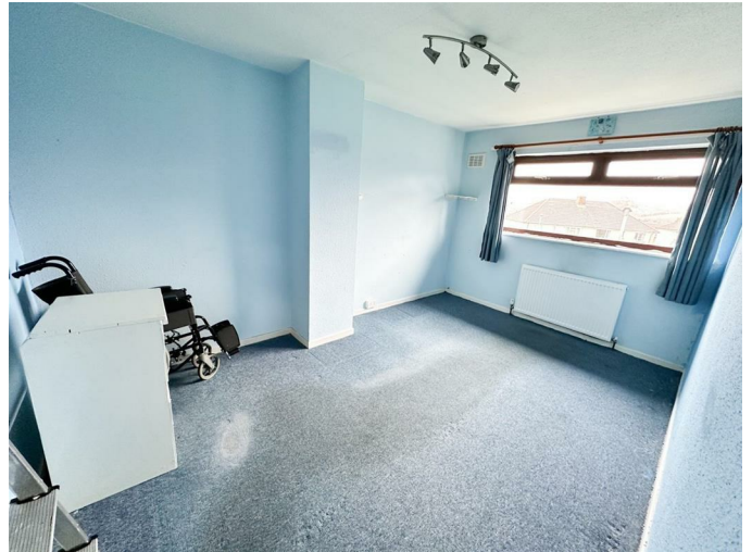
Second Bedroom 8'9" x 14'2" (2.67 x 4.34)