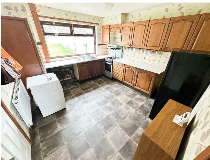
Kitchen 11'11" x 11'5" (3.65 x 3.49)