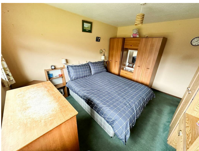
Master Bedroom 10'5" x 12'0" (3.18 x 3.68)