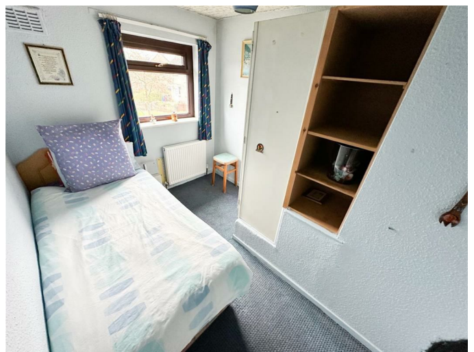
Third Bedroom 7'10" x 10'9" (2.4 x 3.28)