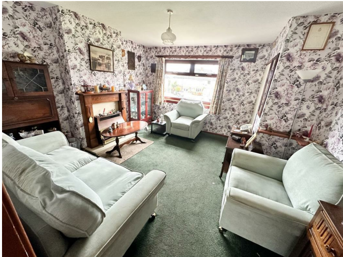
Lounge 13'11" x 13'4" (4.25 x 4.08)