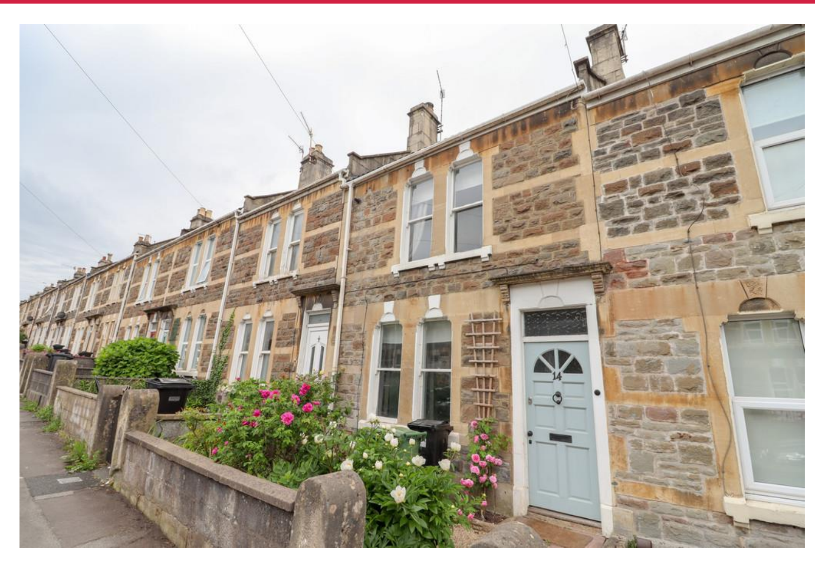
14 Claude Avenue, Oldfield Park, Bath, BA2 1AE