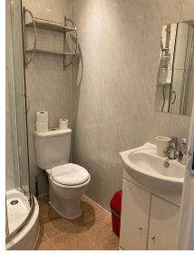
Flat 2, 58 Highfield Avenue, London, NW11 9JD Apartment Area: 228 sq.ft. (21.4 sq.m.) No. of Bedrooms: 1