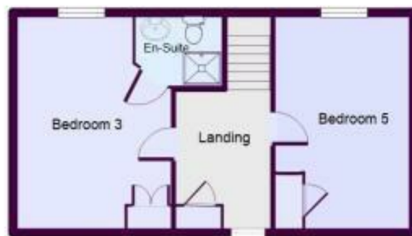
Illustration purpose only

APPROX GROSS INTERNAL FLOOR AREA: 160 sq. m / 1722 sq. ft