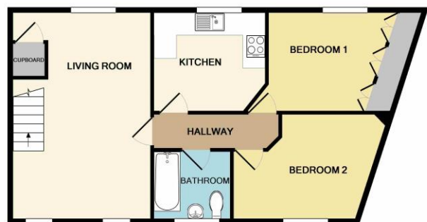
1ST FLOOR APPROX. FLOOR AREA 625 SQ.FT. (58.1 SQ.M.)

Agents Note: These particulars are set out as a general outline only for the guidance of intended purchasers and do not constitute an offer of contract or part thereof. For your information, the agent has not tested any apparatus, equipment, fixtures and fittings or services, so cannot verify they are in working order. A buyer is advised to obtain verification from the solicitor or surveyor. Please note that measurements are approximate only. Any internal photographs or floor plans are intended as a guide only. No responsibility is taken for any omission, error or mis-statement in the particulars.