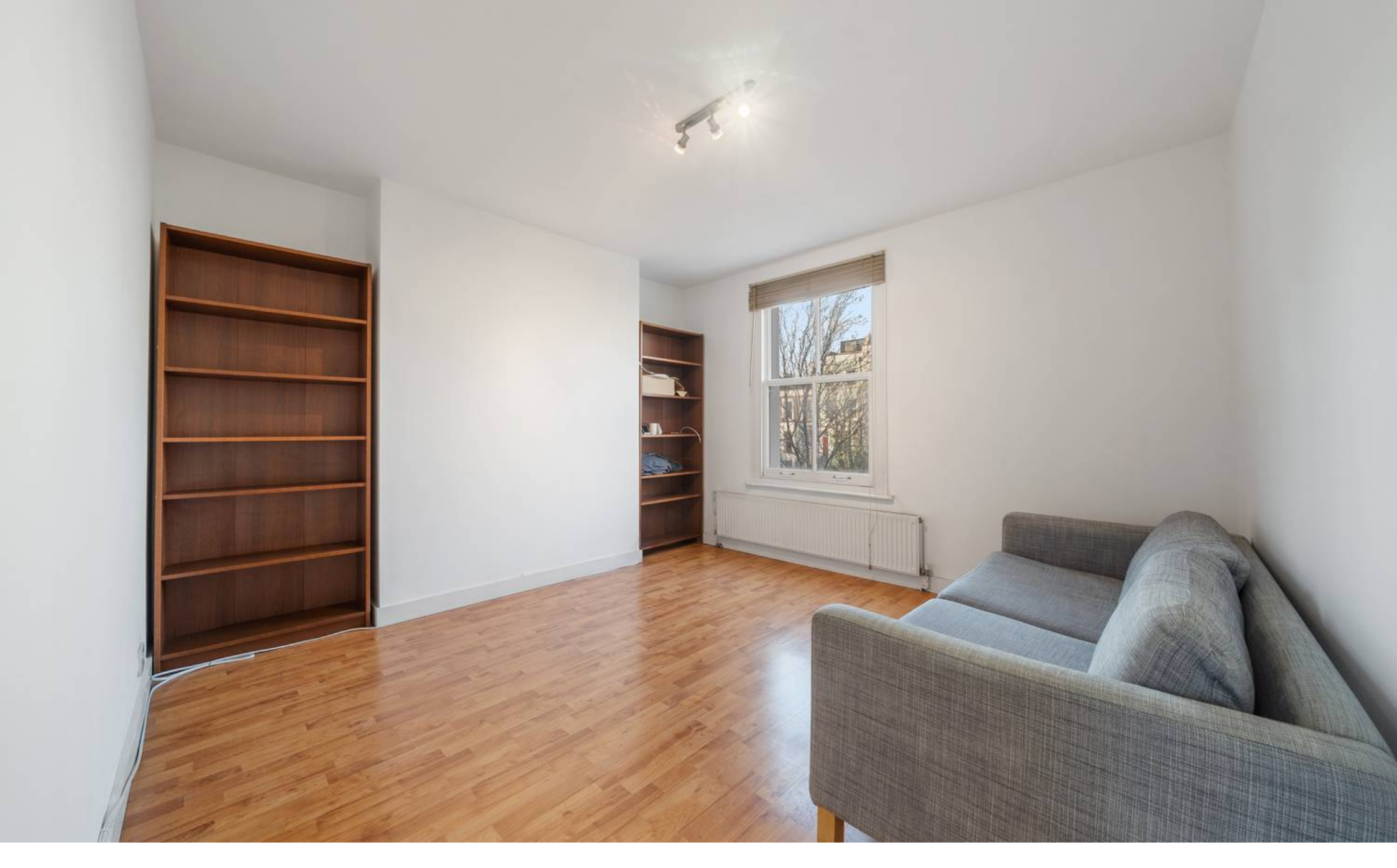
Flat A, 114 Leighton Road, London £2,250 pcm